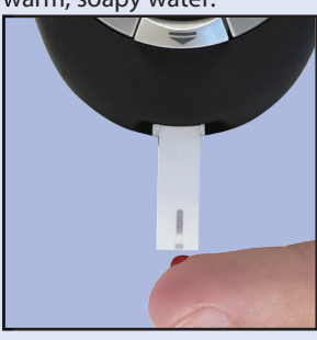
Step 4 With Test Strip still in Meter, touch Sample Tip to top of blood drop and allow blood to be drawn into Test Strip. Remove from blood drop immediately after Meter beeps and dashes appear across Meter Display.