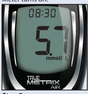
Step 5 In as fast as 4 seconds, glucose result will be displayed with time.