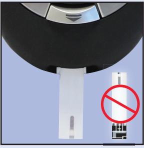
Step 2 Remove test strip from vial and close vial immediately. Insert Test Strip into Test Port with Contact End (blocks facing up). The Meter turns on.