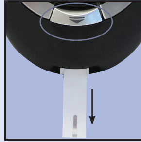
Step 6 Hold Meter with Test Strip pointing down. Press Strip Release Button to discard Test Strip in the appropriate container.

This guide provides a brief overview on testing your blood glucose. If you need information about setting up your Meter with correct date and time, consult the "Getting Started" section of Owner's Booklet. For more detailed information on complete blood glucose testing procedure, consult "Testing Blood" section in the Owner's Booklet.